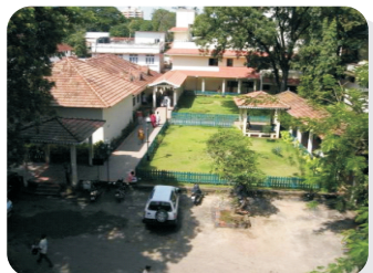
GENERAL HOSPITAL, ERNAKULAM NABH Accredited Hospital

ORGANISED BY Dept.of Radiotherapy and Radiodiagnosis, General Hospital Ernakulam In Association with Indian Society of Radiographers & Technologists(ISRT)